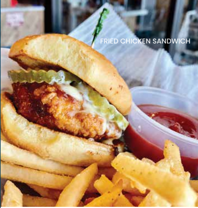
FRIED CHICKEN SANDWICH

Cajun Rub & Italian Style Not Available on Boneless. *Italian Style Wings are Cooked in Garlic & Onions.